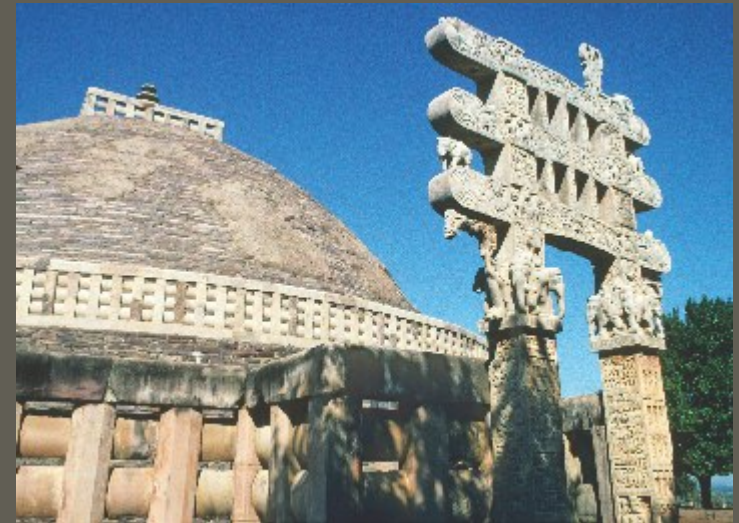
▼ Buddhist Stupa. Sanchi, Madhya Pradesh

Our philosophy focuses on three important aspects.