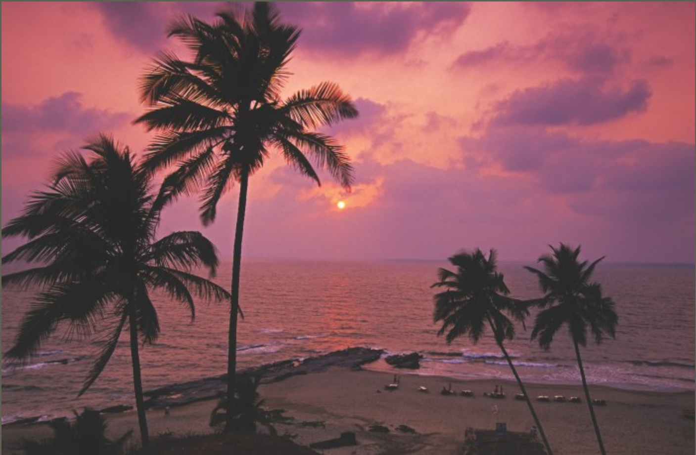
Sunset at Vagator beach. Goa ▲

Whether staying at high end hotels or living in style and experiencing the rich elegant palaces or smaller boutique havelis or sailing while living in the legendary houseboats in Kashmir or backwaters of Kerala, our first hand direct interaction in creating our JHA itineraries will enable you to truly discover this fascinating and truly incredible India.