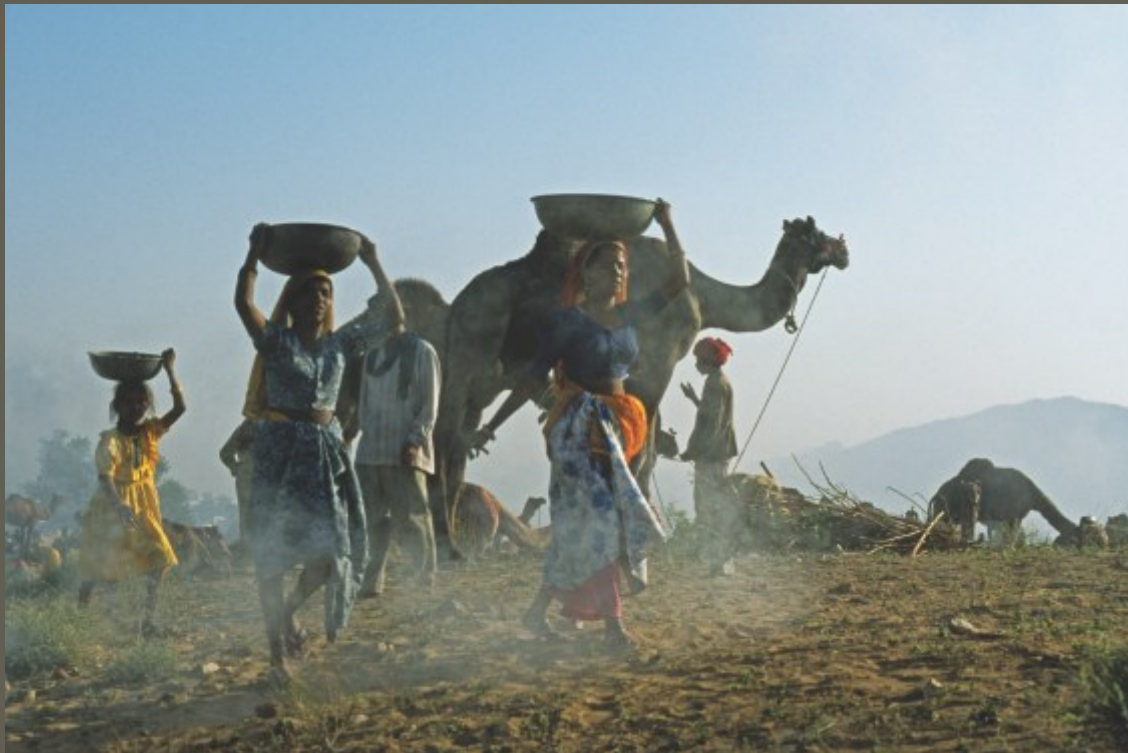
Camels and the Rajasthan desert ▲

At JHA we are very conscious of modern environmental concerns, as we know our customers are too, and consequently take great care in this regard when choosing our service providers.