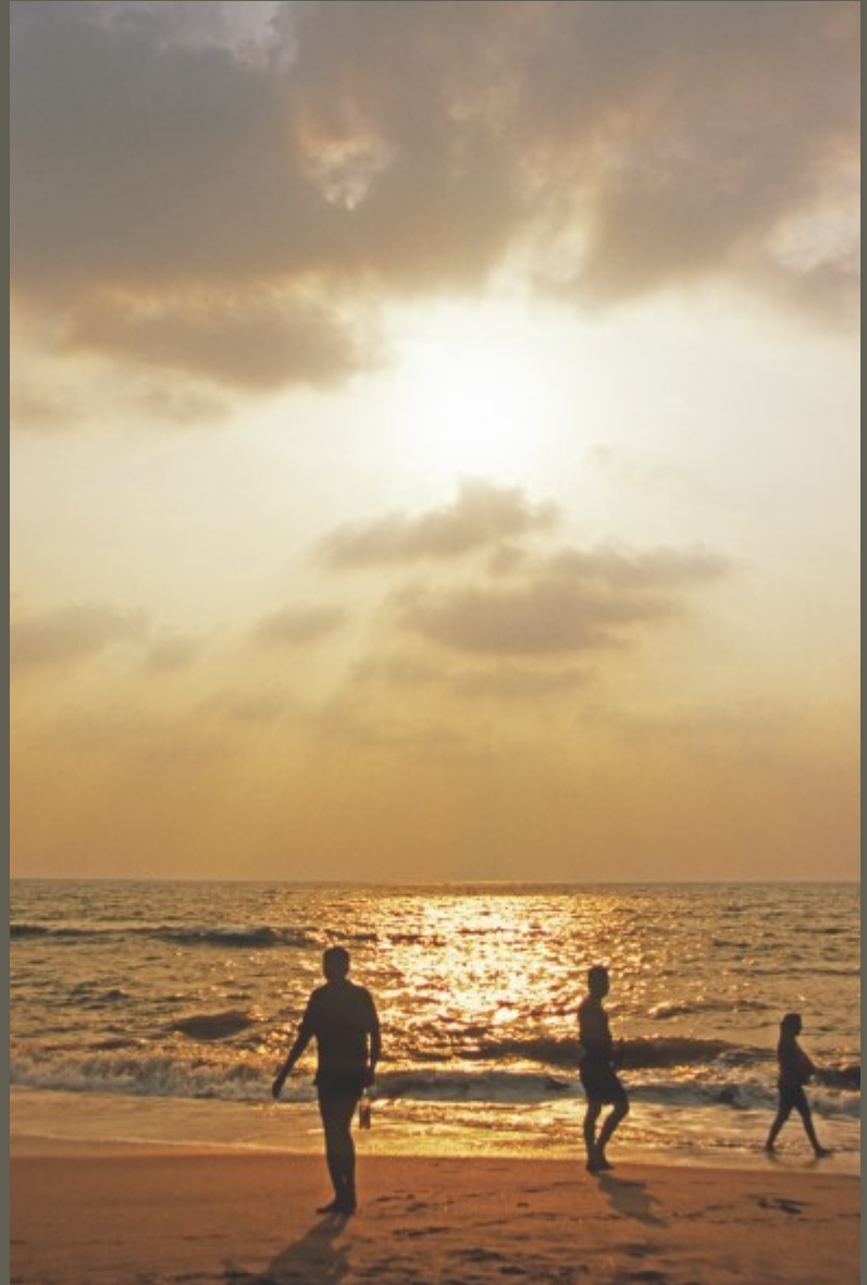
Kovalam beach. Kerala ▶

Together, we shape travel dreams and breathe Jeevan (Life) into your desires.