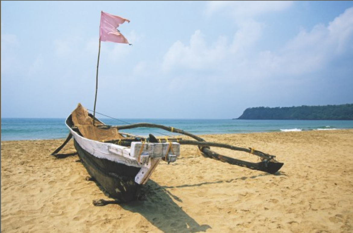
Fishing boat on Agonda beach. Goa ▲

Your total, exclusive care is our aim, desire, and tradition.