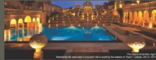
Amarvilas : Agra