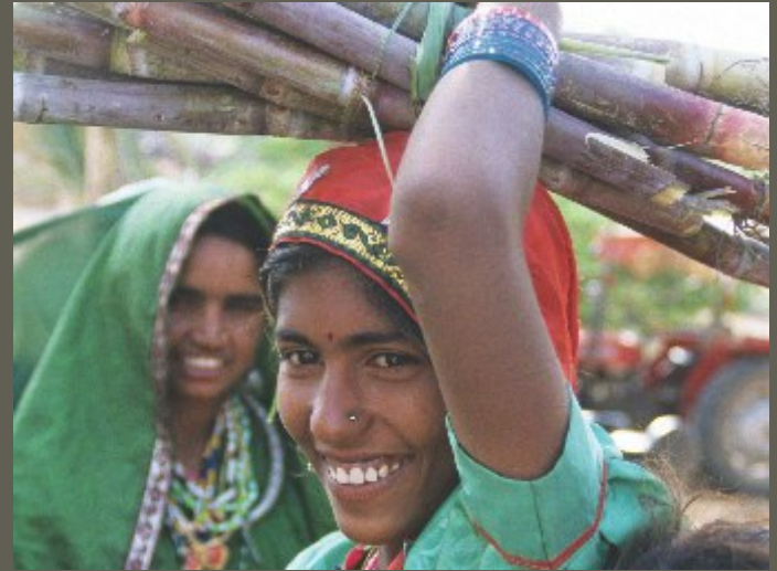
Rajsthani Girl ▲

Rather than discovering India in the usual way as a herd of tourists, we at JHA completely involve you in the process of creating the ideal tour. We continue with our innovative programmes through our networks to bring even more comfort and enjoyment for our guests, and we also welcome their suggestions to us in this regard.