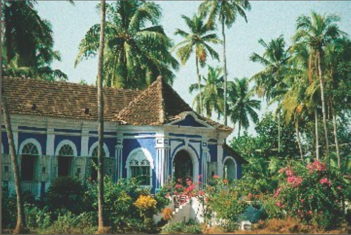
◀ Portuguese colonial house. Goa