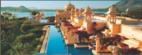
Hotel Udaivilas : Udaipur

JHA can book you into ANY hotel in India that you desire. If you have any particular preferences, please let us know and we will make all the necessary arrangements for you.