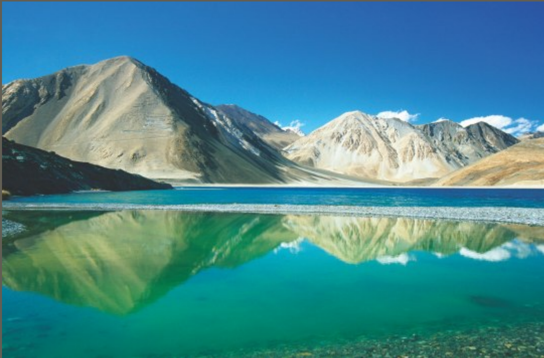
Pangong Lake. Ladakh ▲

Whether you want to reenergize or rejuvenate through the sheer spirituality in the air, or by the mysticism in ancient rituals and practices, or by the exotic beautiful locales; or whether you want to experience the complete mind-body healing of centuries old Yoga-Ayurveda or be enriched by the history, religion, rich heritage, languages and colourful people... India Offers It All From North To South & From East To West.