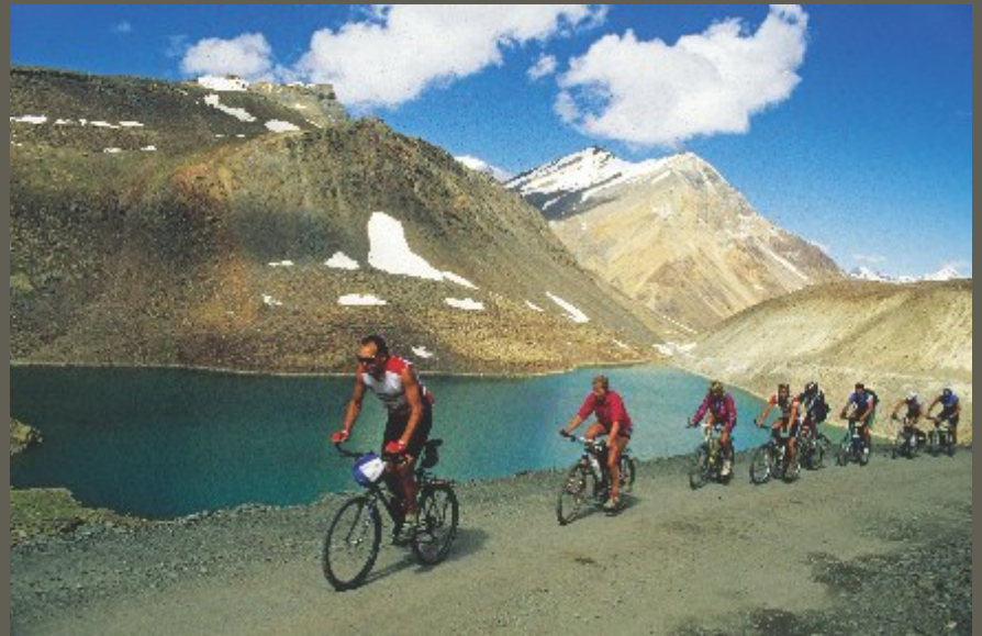
Adventure sports : Cycling in Himachal Pradesh ▲