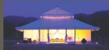
Aman-i-khas Resort : Ranthambore

FOR MORE INFORMATION, ITINERARIES AND BOOKINGS, PLEASE VISIT OUR WEBSITE